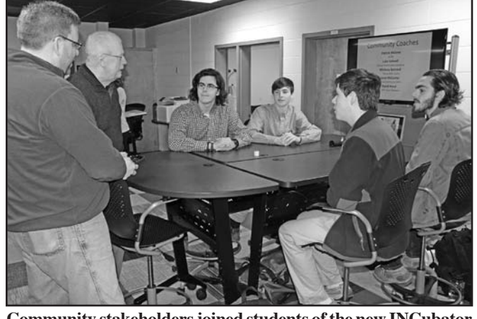
Community stakeholders joined students of the new INCubator Edu classroom for a tour and a luncheon on Friday, Feb. 10.

students interact directly with business professionals from around Blairsville and Union